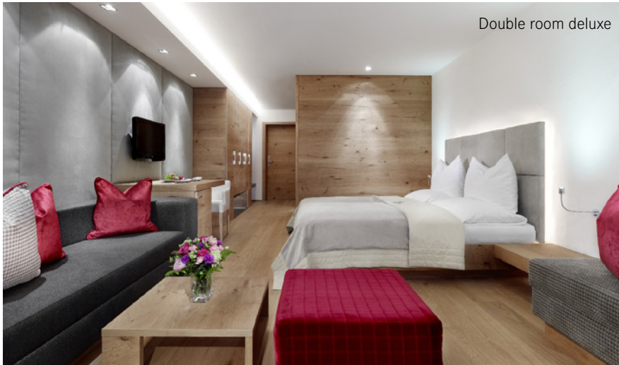
Double room deluxe